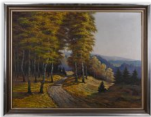
LOT: 241 / ID: 7425 - AUTUMN ALLEY Fr. Böhm (???? - ????) 1940, H x W: 104 x 135 cm, Oil on canvas Starting price: 2 000 CZK / 80 EUR

Painting of an autumn alley by a now unknown author.