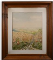
LOT: 243 / ID: 7440 - SUMMER DAY E. Frühauf-Buschmann (???? - ????) 1944, In frame H x W: 63 x 49 cm, Watercolour, paper Starting price: 1 000 CZK / 40 EUR

Original drypoint by Josef Jíra from 1980, signed and dated lower right: Josef Jíra 80, adjusted in mount, framed under glass, dedication to a friend at the bottom left.