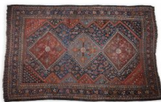
LOT: 247 / ID: 7646 - CARPET III H x W: 290 x 197 cm, Wool Starting price: 2 000 CZK / 80 EUR

Oriental carpet kazak with geometric patterns.