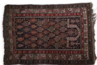
LOT: 246 / ID: 7645 - CARPET II H x W: 106 x 151 cm Starting price: 2 000 CZK / 80 EUR

Oriental carpet Kelim with geometric patterns.