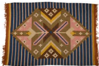
LOT: 245 / ID: 7651 - CARPET I H x W: 171 x 117 cm, Cotton Starting price: 1 000 CZK / 40 EUR